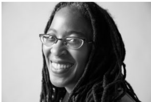
Camille Dungy, 4/8/22, Writers Showcase Poet

Due to continuing COVID restrictions all 2022 readings/workshops were held again on the Zoom platform. Our 2022 April Poetry month featured Writers Showcase Poet, Camille Dungy , who presented a reading on 4/8/22 and a generative workshop (From 0-99) on 4/9/22